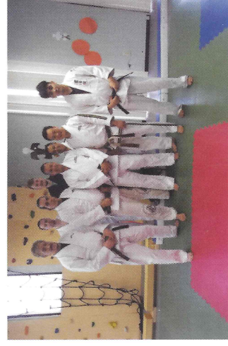
Sensory TKD Instructors